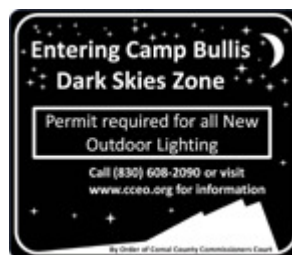
(Click for Larger Image)

This Order also authorized the County Engineer to place signage along the public right-of-way adjacent to the Camp Bullis Dark Skies Zone to enhance awareness of this Order. An example of this signage is below: