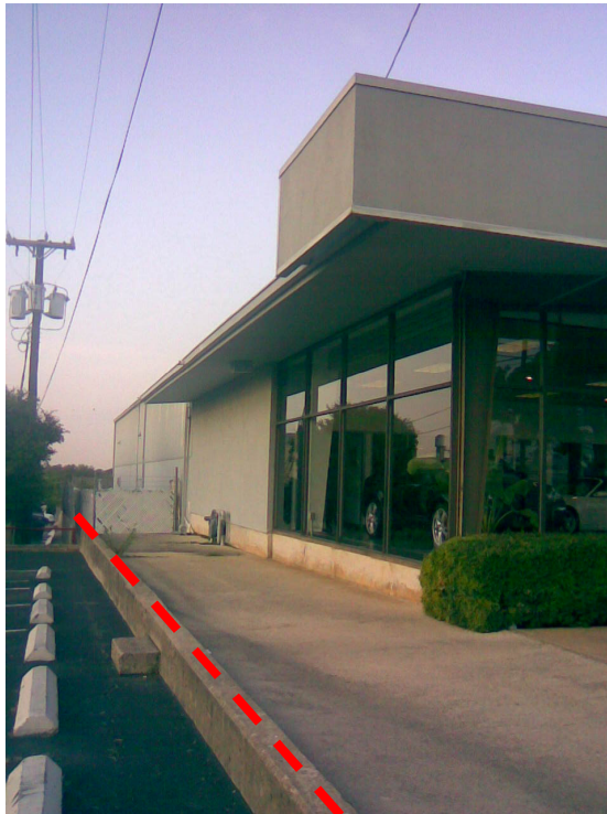
South Line – Next to Jim's

Obviously, Porsche doesn't have any landscape buffering at their current location