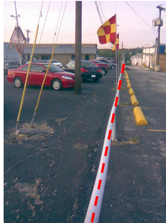
North Line – Next to Pawn Shop

Current Porsche Dealership 4623 Fredericksburg Rd, San Antonio, TX